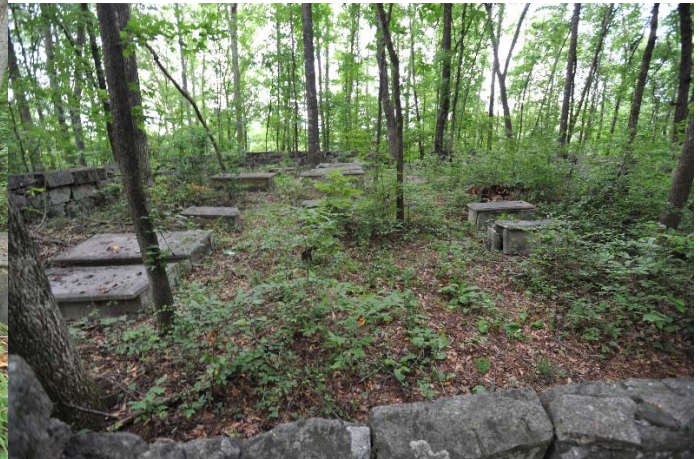
Hulsey Family Cemetery