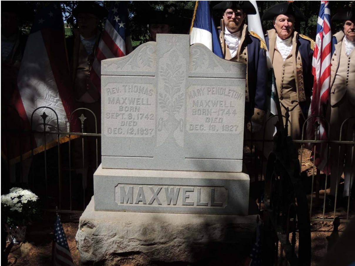
Members of the State Color Guard stand behind the Maxwell monument