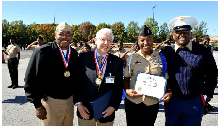
Stephenson High School