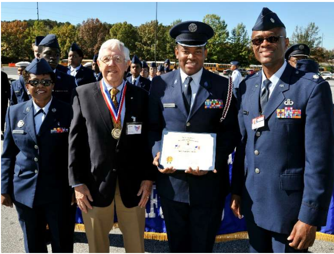
Tucker High School