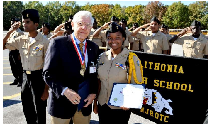
Lithonia High School