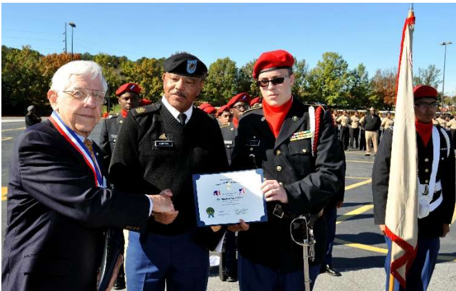
Chamblee High School