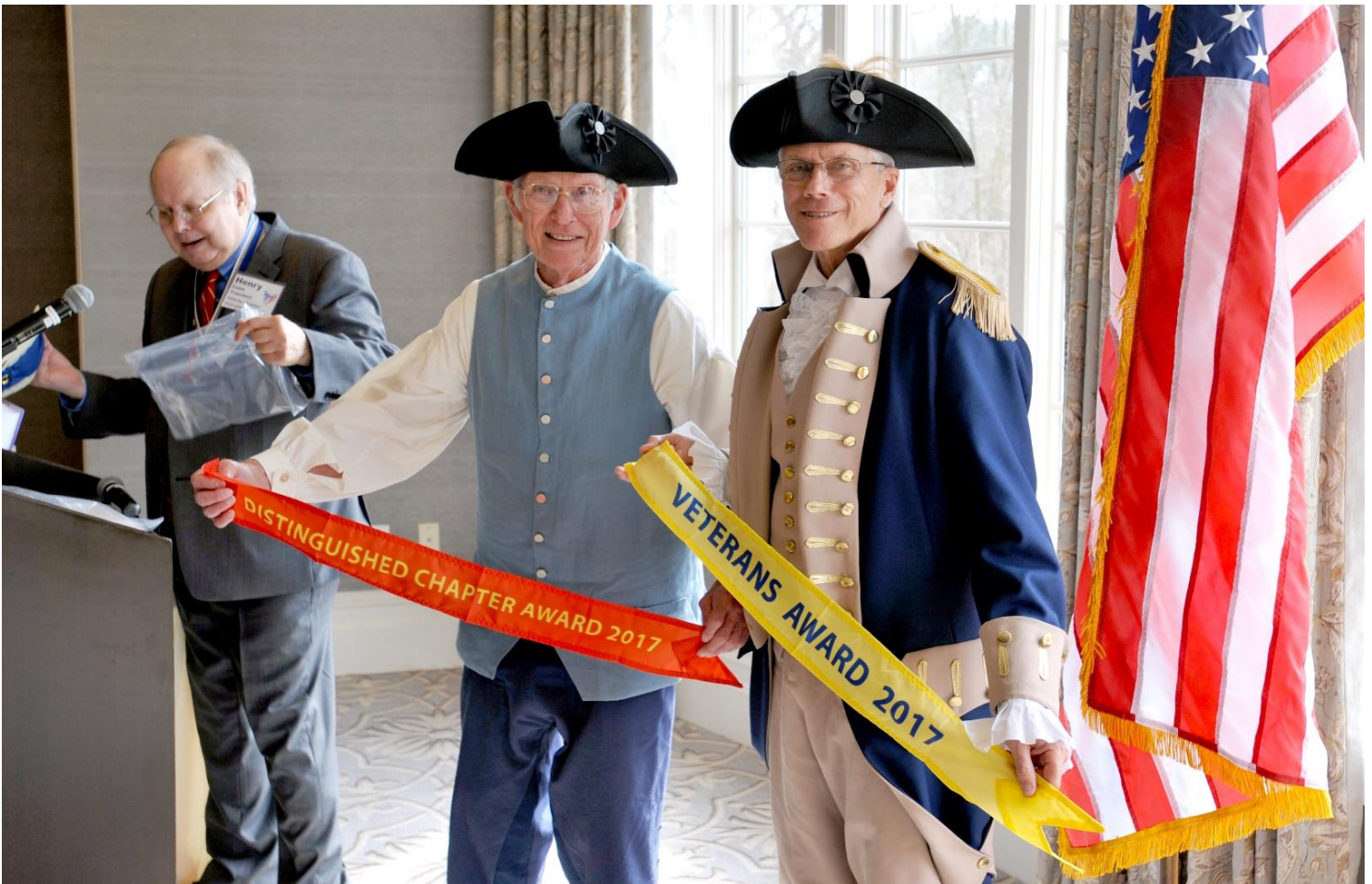
Two of the award streamers to be placed on our flag pole.