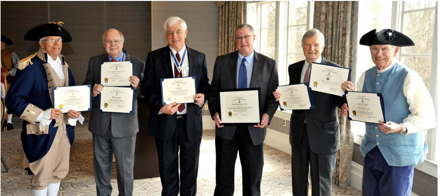
Members holding Certificates representing the above awards