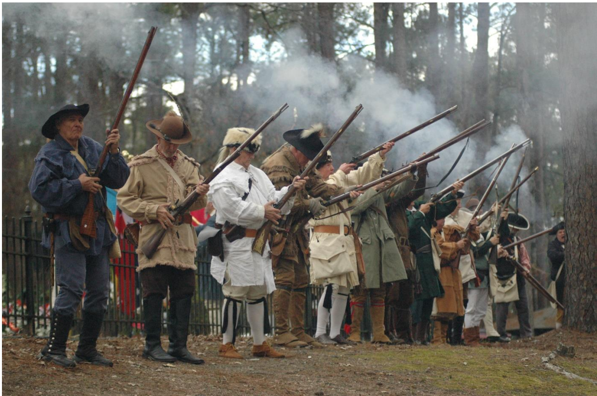
Firing of muskets