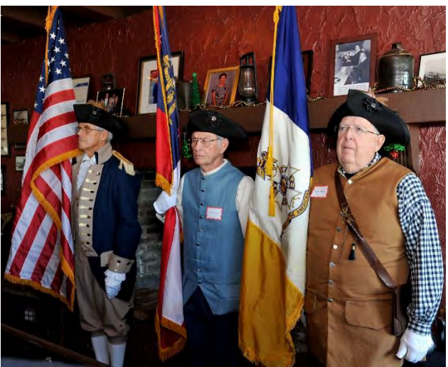
The Colors were presented by the Atlanta Chapter Color Guard