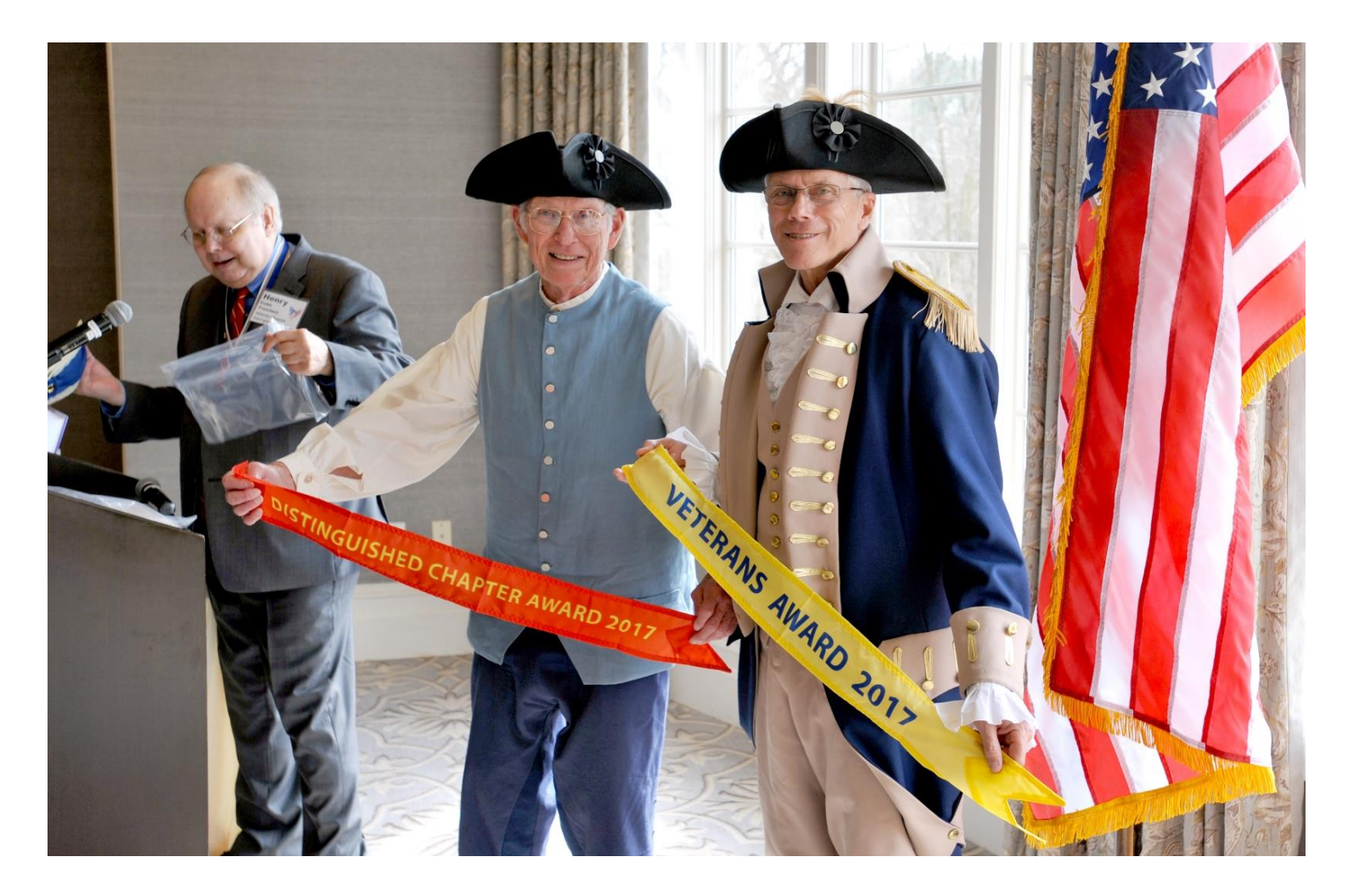
Two of the award streamers to be placed on our flag pole.