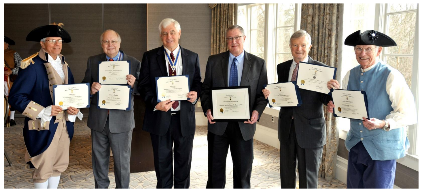
Members holding Certificates representing the above awards