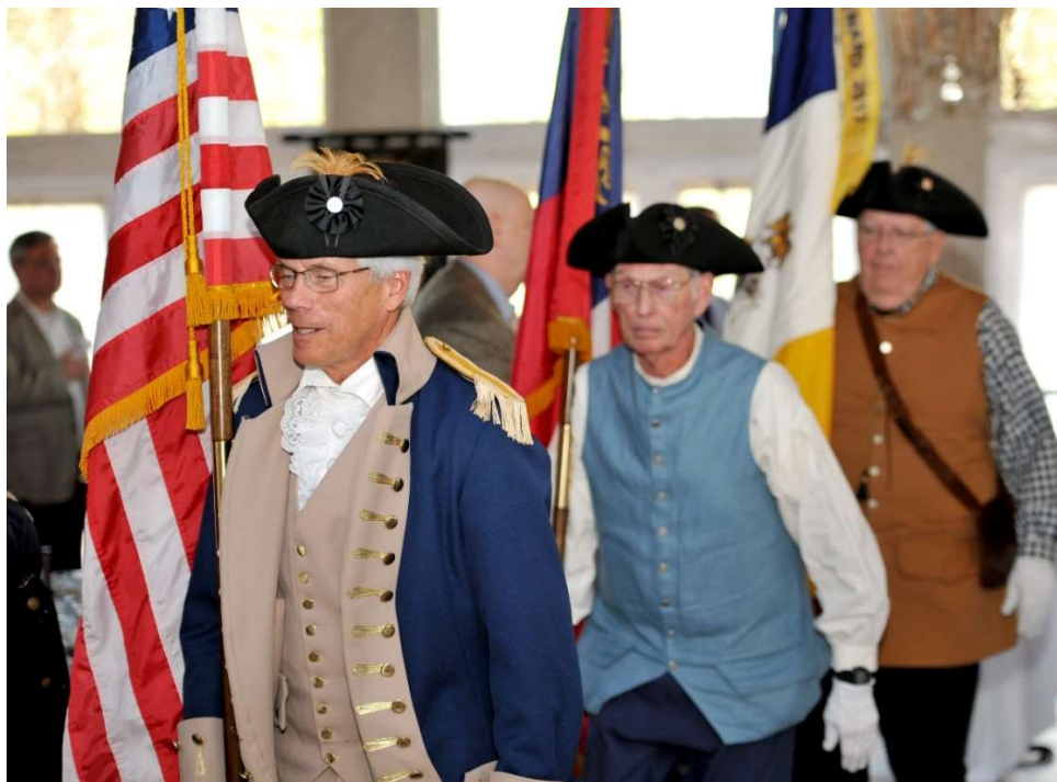
Members of the Atlanta Chapter Color Guard