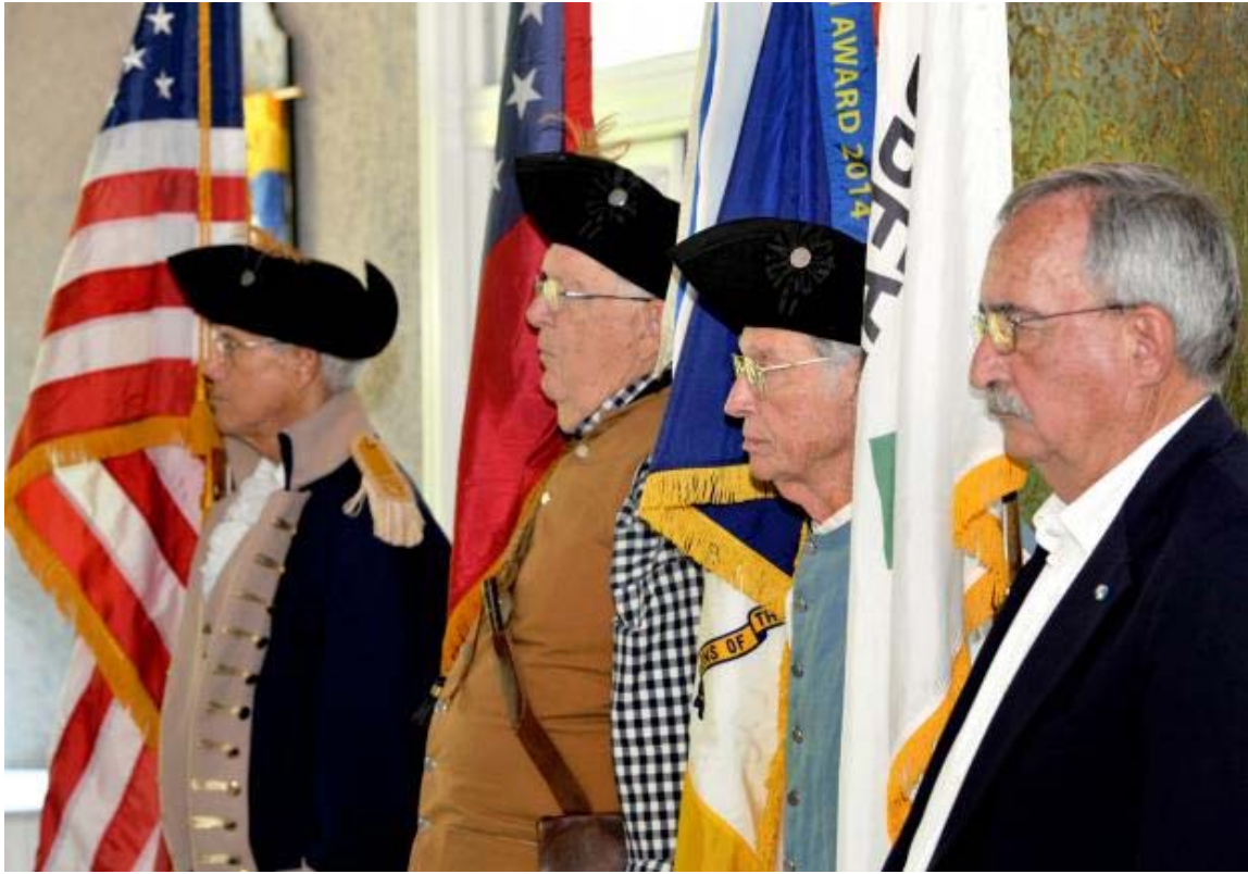
Members of the Atlanta Chapter Color Guard