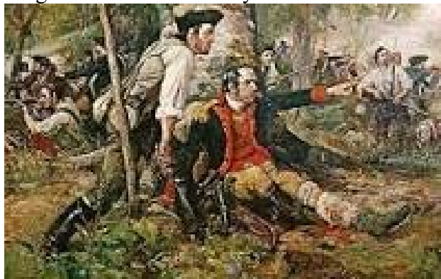
General Nicholas Herkimer