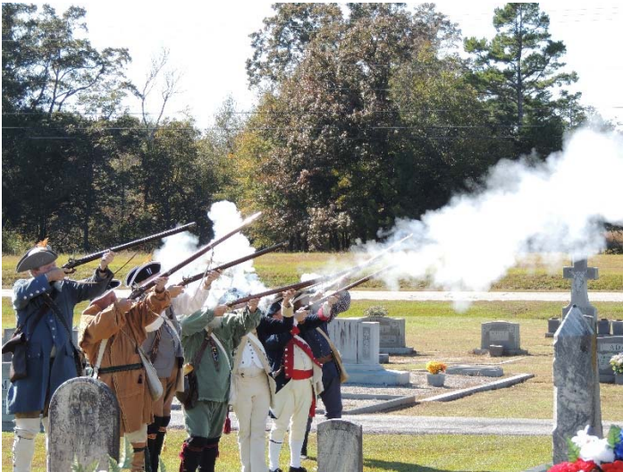
Firing of the muskets