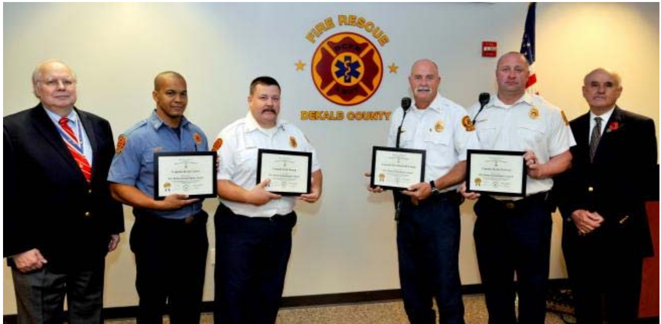
Atlanta Chapter presents Fire Certificates to four DeKalb County firefighters for their dramatic Efforts in rescuing several residents from the Avondale Forest Apartments during a fire on January 3, 2018. In addition we presented Flag Certificates to 3 Fire Stations.