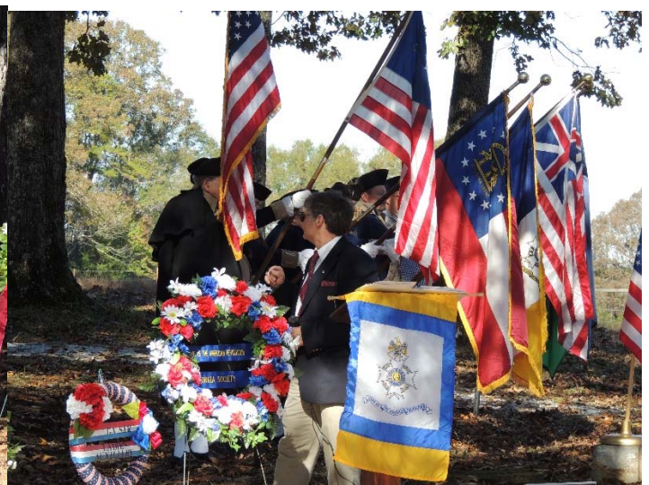
Georgia Color Guard presents the colors at the grave marking.