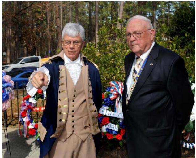
Parts of the ceremony held at Elijah Clark State Park.