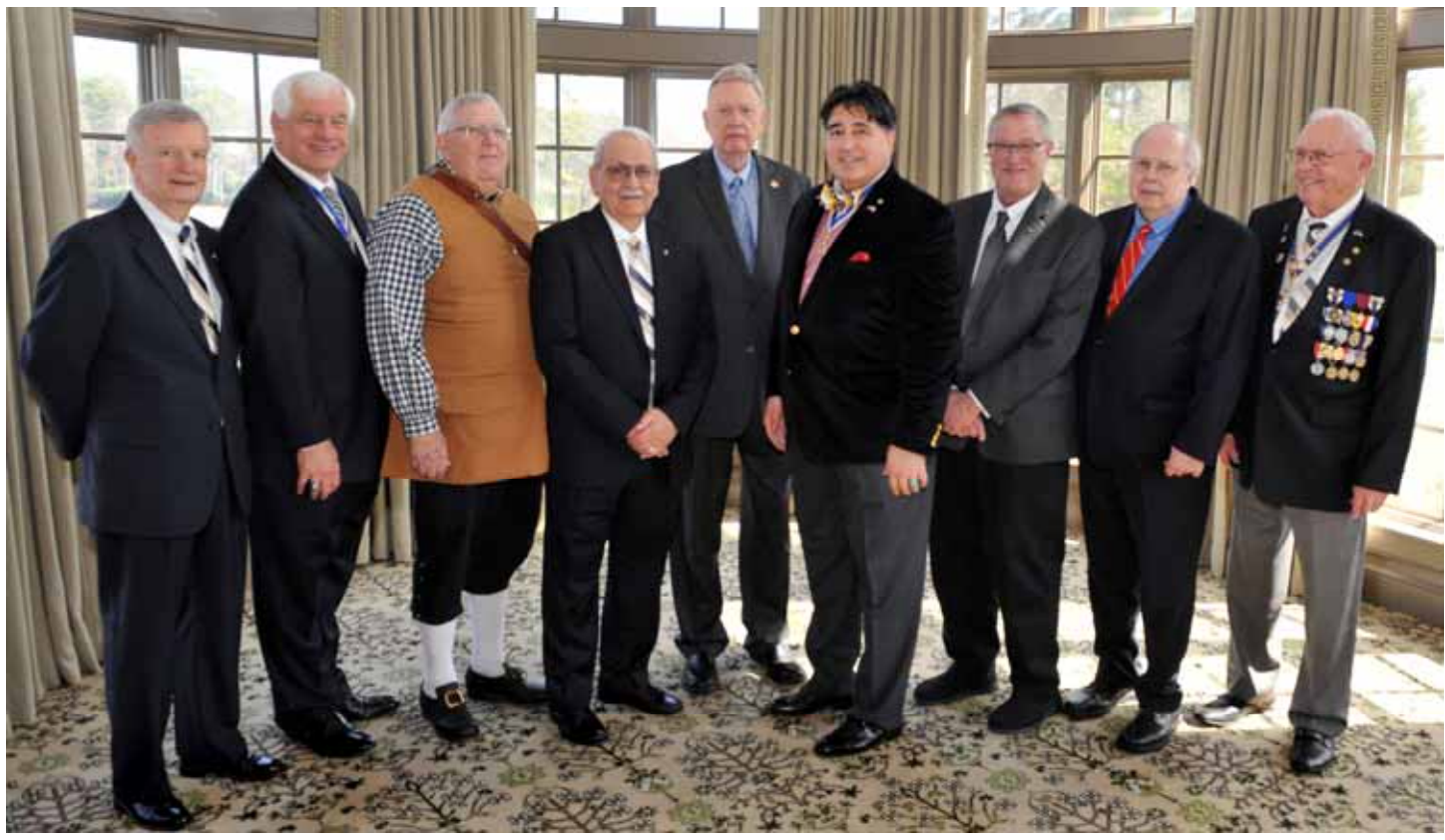
The Atlanta Chapter SAR Officers lineup for 2020