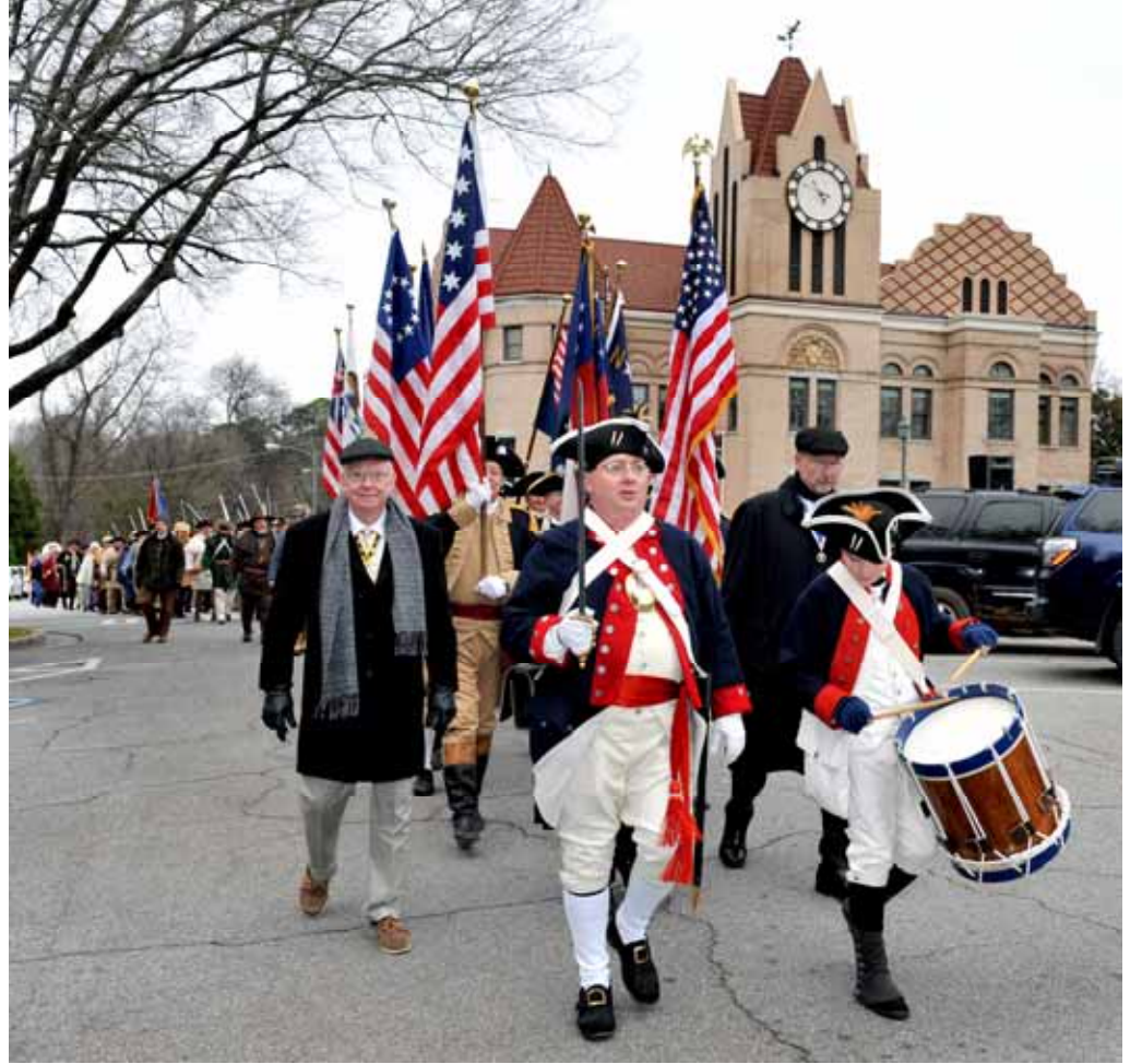
The Parade starts off on the beautiful Square in Washington, Georgia