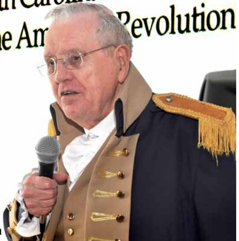
William Washington February 28, 1752- March 6, 1810 Born in Stafford County, Virginia Second Cousin to George Washington

South Carolina Heroes of the American Revolution