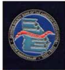
Centennial Lapel Pin

These are Hot Items! Get yours now before they're gone!