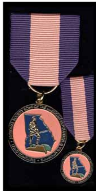
Congress Medal Set