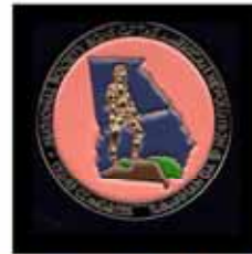
Congress Lapel Pin