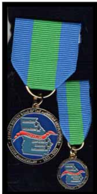
Centennial Medal Set