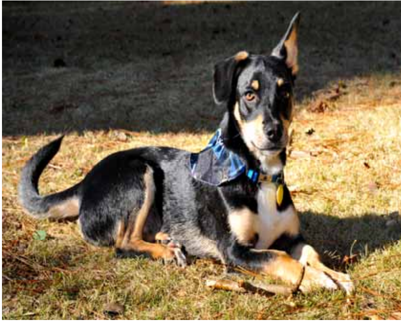
Pancho Villa Smith-Wysong, our National Dog Day Mascot