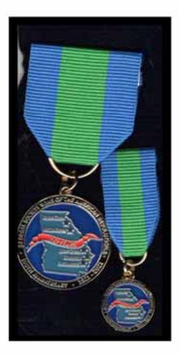
Centennial Medal Set