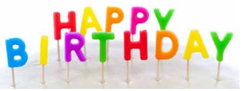
The following members have a birthday this month:

Hanukkah is a Jewish festival commemorating the rededication of the Second Temple in Jerusalem at the time of the Maccabean Revolt against the Seleucid Empire. It is also known as the Festival of Lights. Hanukkah is observed for eight nights and days. The festival is observed by lighting the candles of a candelabrum with nine branches, called a menorah. Each night, one additional candle is lit, until all eight candles are lit together on the final night of the festival.