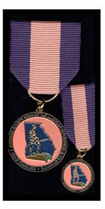
Congress Medal Set