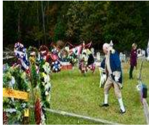
ATL Chapter Charlie Newcomer