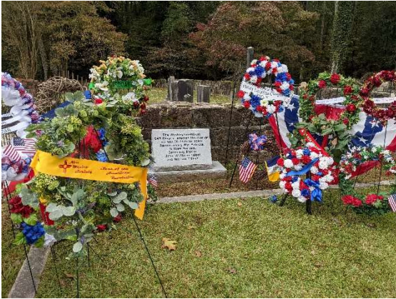
SAR Chapter Washington-Wilkes marker