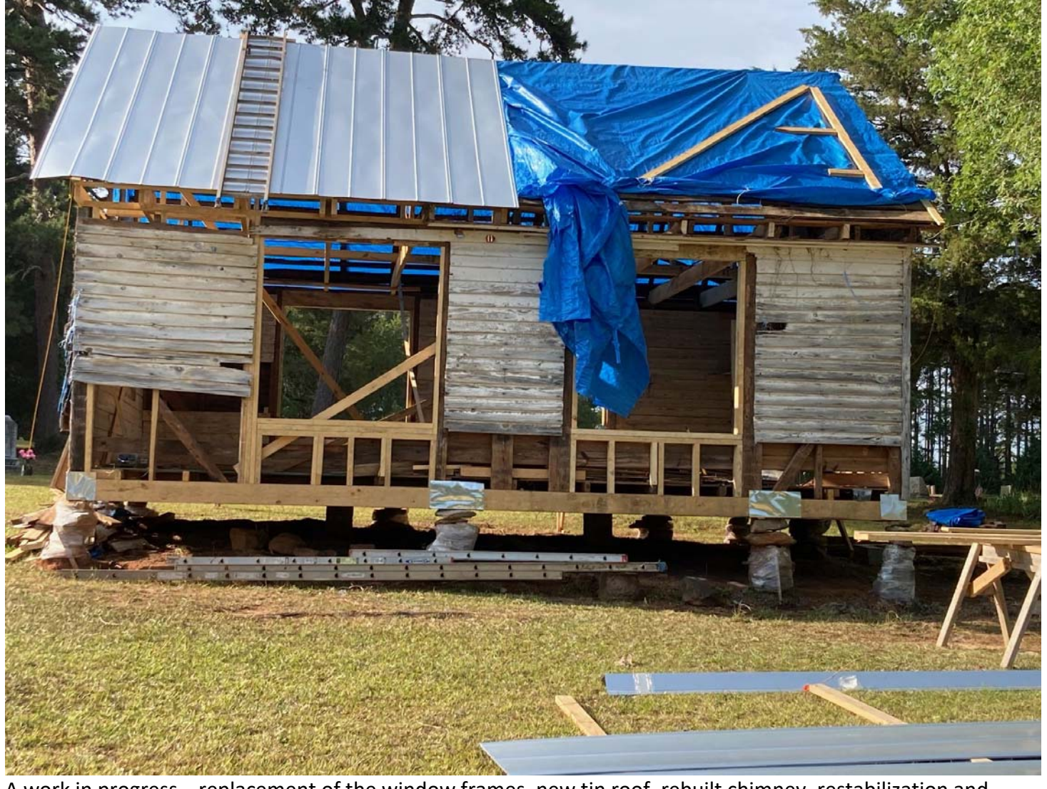
A work in progress... replacement of the window frames, new tin roof, rebuilt chimney, restabilization and sealing of the stacked field stone piers. The beams and rafters were also replaced where needed, while retaining as much of the original clapboard frame as possible.

The rehabilitation has been extensive. Meticulous steps were taken in phases outlined in the Historic Structure Report (HSR) provided by the University of Georgia. Every effort was made to ensure that the structure did not collapse during the various phases of rehab.