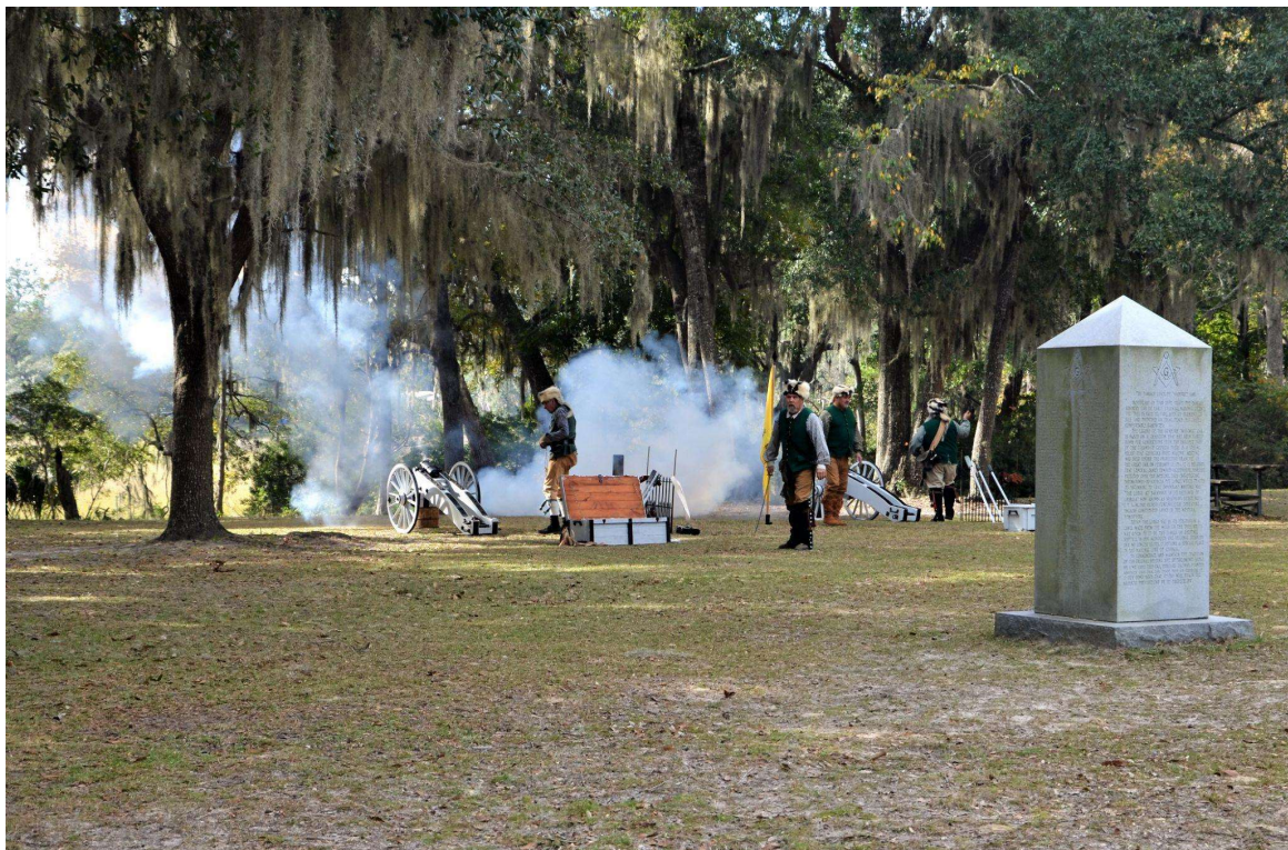
Cannon salute in commemoration of the observance!