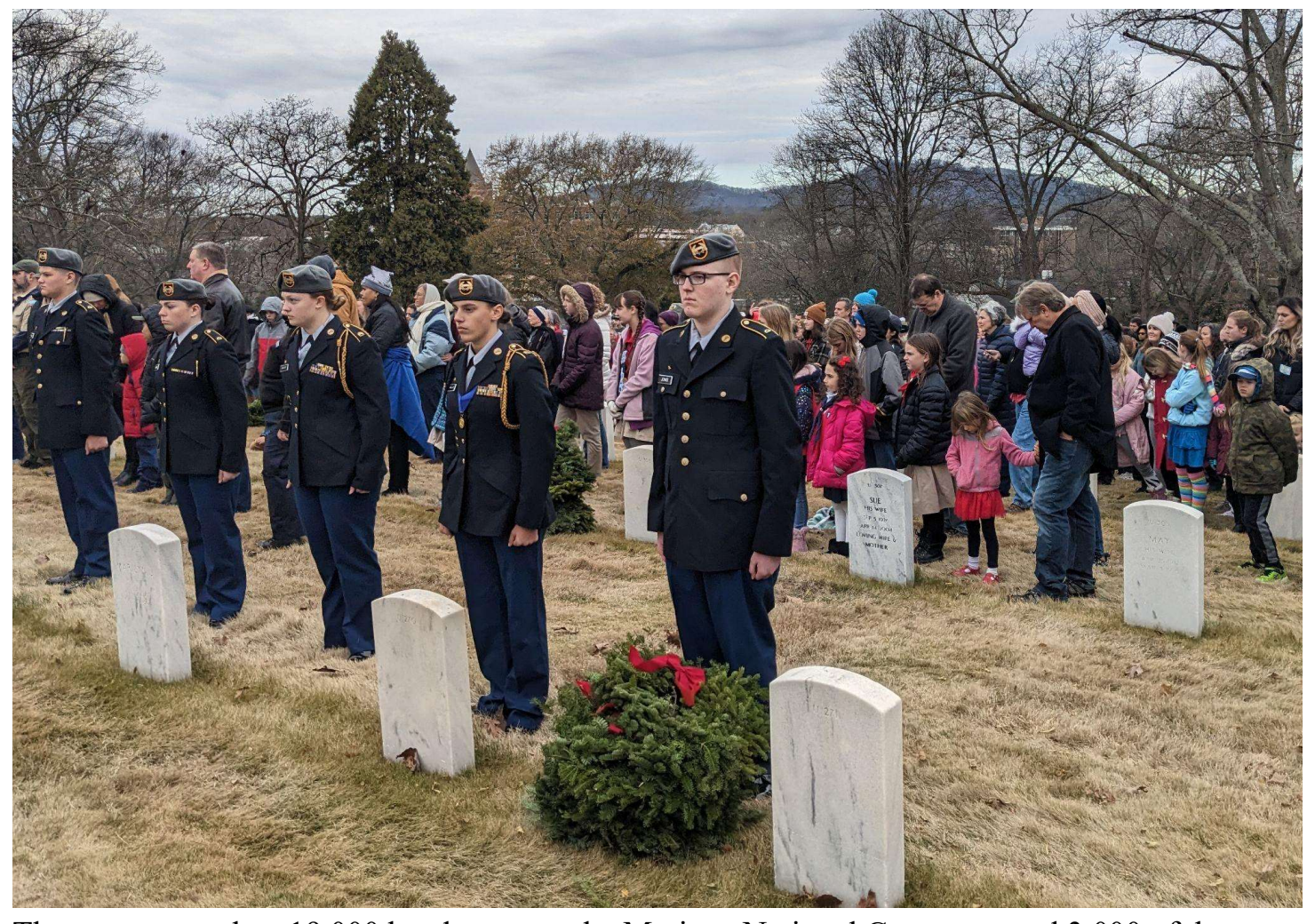
There are more than 19,000 headstones at the Marietta National Cemetery, and 3,000 of them mark the graves of unknown soldiers.