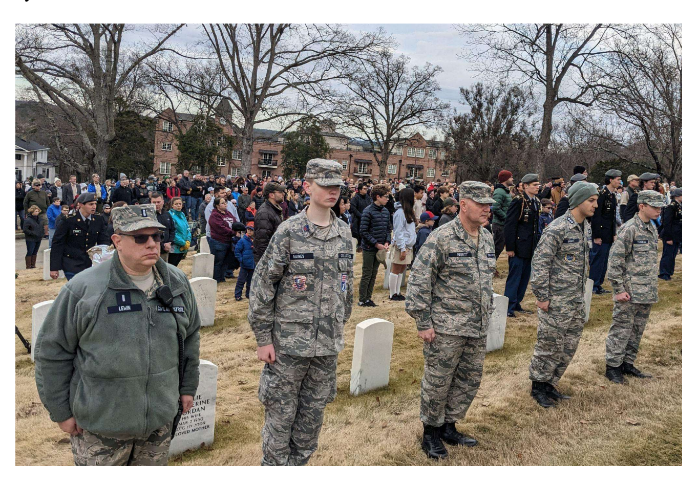
Currently, less than 30% of the tombstones will have wreaths on them.