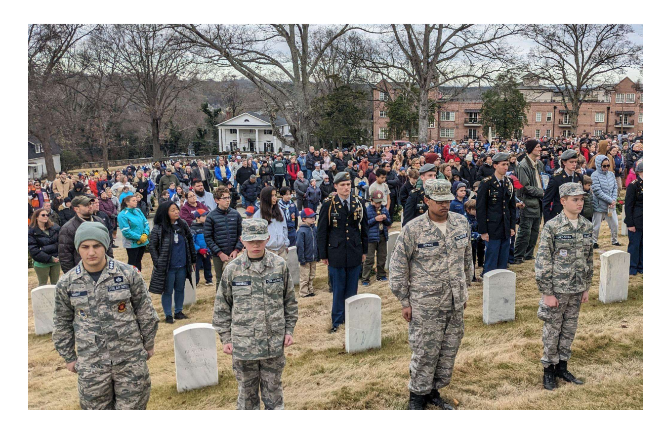
More than 70% of veterans buried at Marietta National Cemetery don't have a wreath for the holiday season.