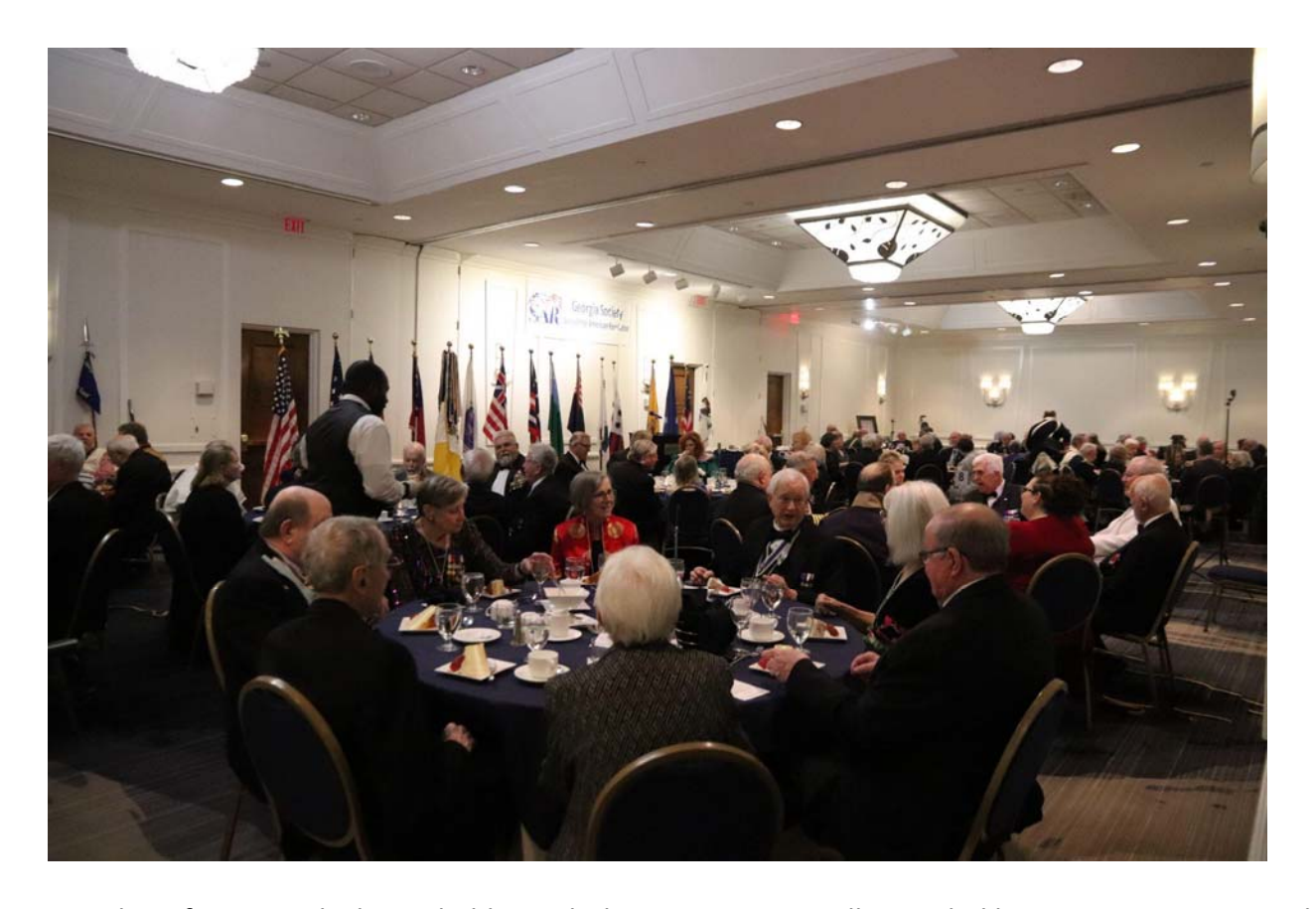
The Annual Conference, which was held in Duluth, Georgia, was well attended by Compatriots statewide.