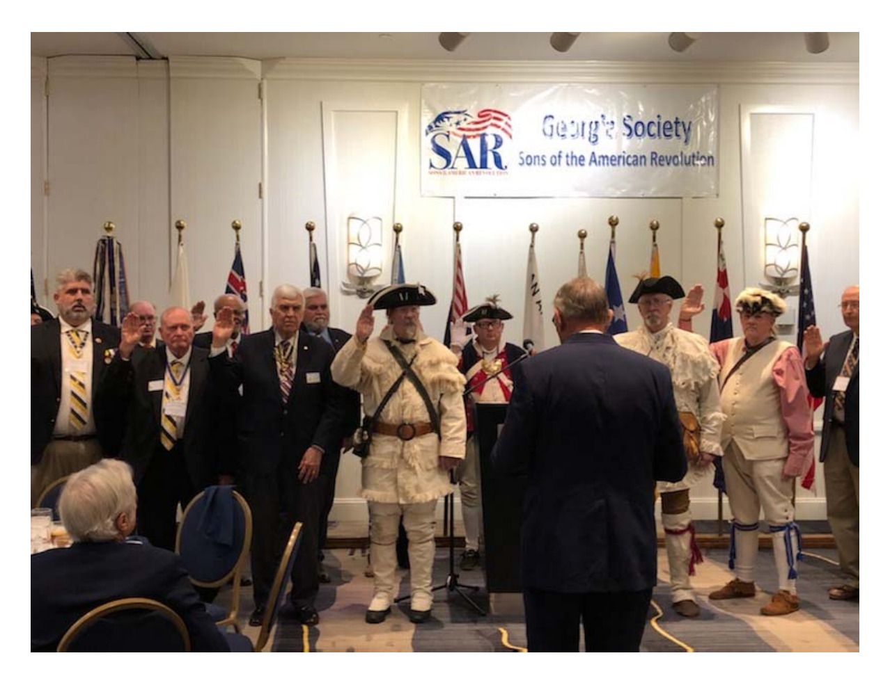
Induction of GASSAR Officers was also held at the Annual Meeting on Saturday 28th.