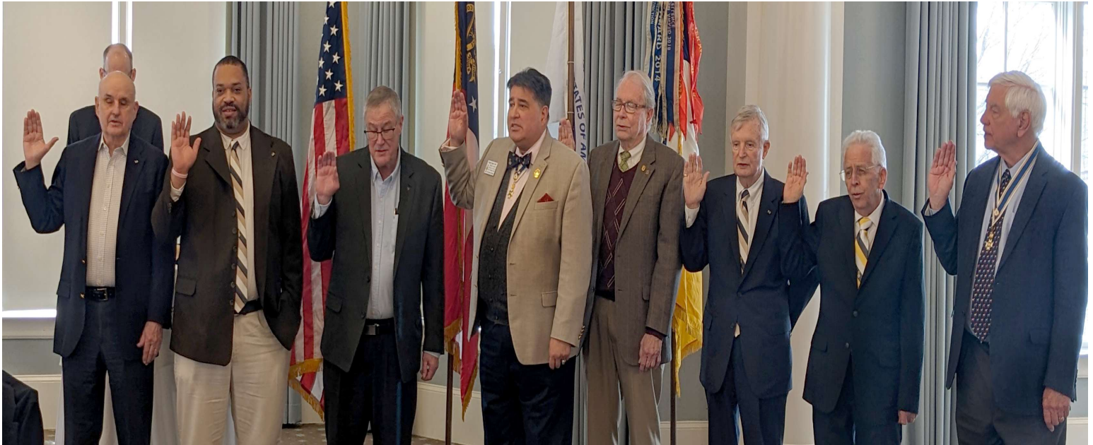
2025 Atlanta Chapter Sons of the American Revolution Officers